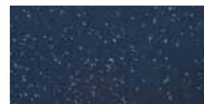
ME 10 Blue