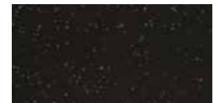
ME 16 Black