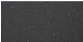
ME 04 Dark Grey