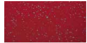
ME 21 Bright Red